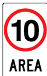
450x750 Class 1 Reflective Aluminium R67RA1