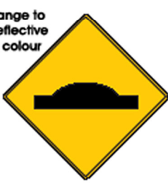
R69RA1 600x600 Class 1 Reflective Aluminium

May change to Fluoro Reflective Line in colour