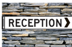
Code : RSB150 150x1000mm

To direct visitors around your complex. Street blades are made from Extruded Aluminium and are resistant to most weather conditions. Available in 150mm or 200mm wide and up to 1 metre long. Black lettering (Double Sided) on a white Retro Reflective Class 2 background for ease of viewing day or night. Logos and extra colours to be quoted separately. 60mm Diameter Posts available in 3 lengths (see diagram) Brackets and post must be ordered separately.