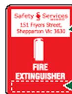
F236-custom SOLD INDIVIDUALLY 55x90

Attaches to vehicles with magnetic base on beacon, operates by plugging into your cigarette lighter.