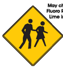
R68RA1 600x600 Class 1 Reflective Aluminium

May change to Fluoro Reflective Line in colour