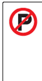
450x225mm R47A Both Aluminium