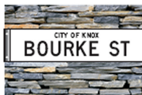
Code : RSB200 200x1000mm