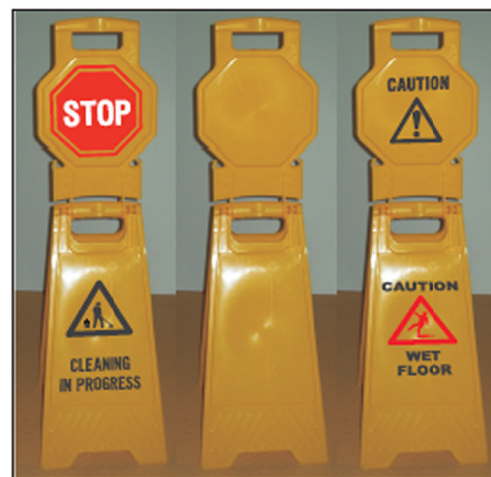
Customise your own design AFPLY AFP12

Also available are Custom Made A frames, ask for a quote.