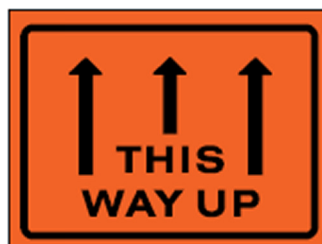
Size 100mm x 75mm Roll of 500 labels Code: LABP320