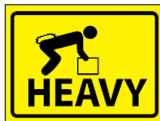
Size 100mm x 75mm Roll of 500 labels Code: LABP315