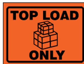
Size 100mm x 75mm Roll of 500 labels Code: LABP325