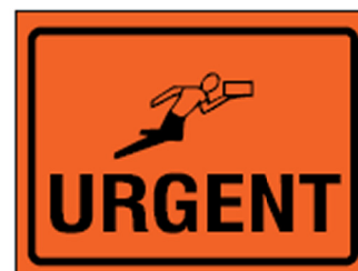
Size 100mm x 75mm Roll of 500 labels Code: LABP330

These self stick paper labels come in rolls of 500, highly visible in fluorescent colours. Each colour label has a weight class (see left) to minimise "Weight Related" workplace injuries and improve workplace safety.