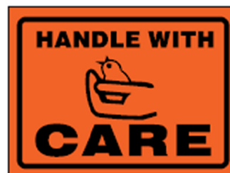
Size 100mm x 75mm Roll of 500 labels Code: LABP310