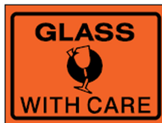
Size 100mm x 75mm Roll of 500 labels Code: LABP305