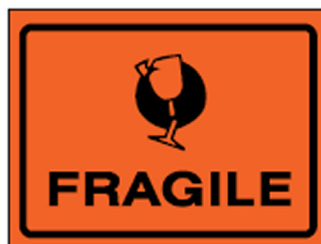
Size 100mm x 75mm Roll of 500 labels Code: LABP300