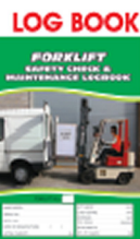
LOG BOOK FORKLIFT

Forklift details eg. Rego no. Make model, lifting capacity and attachments. Daily checks 12 month recording (3 shifts) Fault reporting. Servicing details and recommended preferred service providers. Available in a re-sealable plastic pocket.