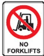
P532 AP 450x600