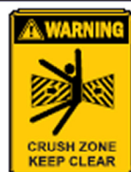
W940 JS 100x140 FS 150x225