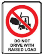
P508 AP 450x600