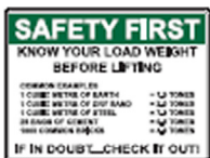
S709H AP 450x600