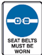
M432 KS 55x90 JS 100x140