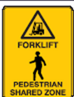
W948C BM 300x450