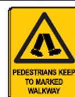
W974 AP, AM 450x600