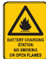
W922 BP, BM 300x450