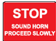
T884 AP, AM 450x600