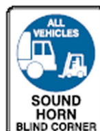
M353C AM 450x600