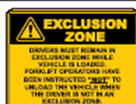
W947 AP, AM 450x600