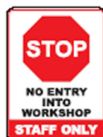
B187 CP, CM 225x300 AP, AM 450x600

REFER TO RED CODE: (ie CP) UNDER IMAGE IN OUR PRICE LIST FOR COMPLETE PRODUCT DESCRIPTION