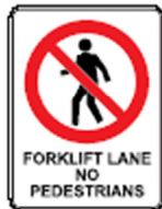
P514 AP 450x600