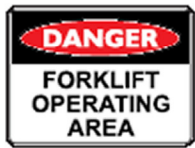
D74 CP, CM 225x300 BP, BM 300x450 AP, AM 450x600