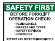
S709C AP 450x600