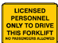
T825 JS 100x140 FS 150x225