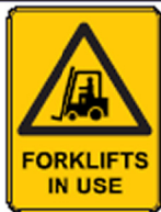
W948 CP, CM 225x300 BP, BM 300x450 AP, AM 450x600