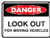
D119 AM 450x600