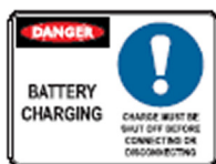
D26 BP 300x450 AP 450x600