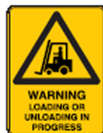
W1001C AM 450x600