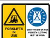
W949 BM, BS 300x450 AM 450x600