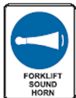
M382C BM 300x450