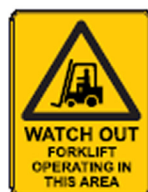
W998 BP, BM 300x450 AP, AM 450x600