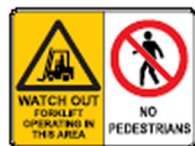
W999 AP, AM 450x600