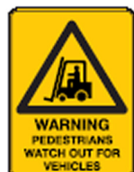
W1001F AM 450x600