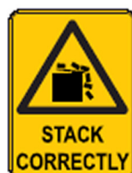
W990 AP 450x600