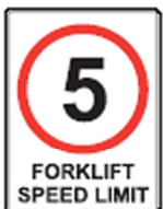
T862 AP, AM 450x600