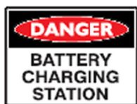
D26A BM 300x450