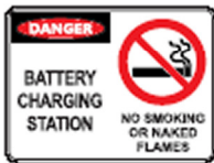
D27 BP 300x450 AP, AM 450x600